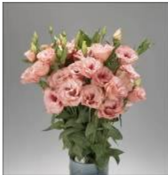
Super Magic Apricot