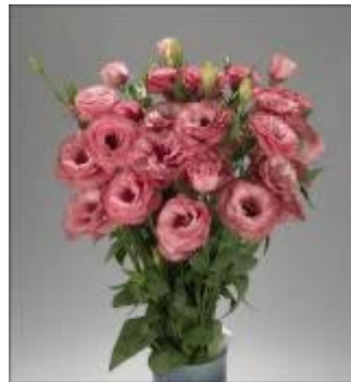
Super Magic Sorbet