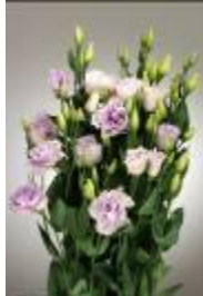
Super Magic Lavender