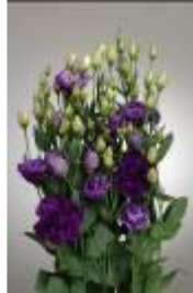
Super Magic Purple