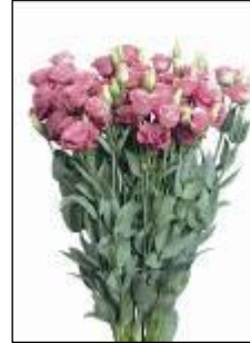
Papillion Rose Pink