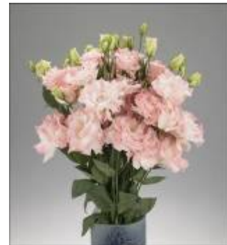
Magic Misty Pink