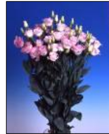
Papillion Pink Flash